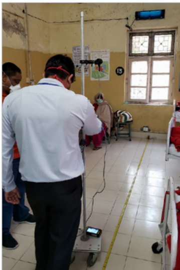
◆ FIGURE 4 GUV meter with sensor mounted at eye height