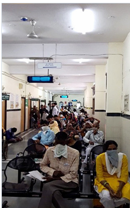
FIGURE 1 Naturally ventilated outpatient department waiting room equipped with ceiling fans and upper-room GUV fixtures. National Institute of Tuberculosis and Respiratory Diseases, New Delhi, India.