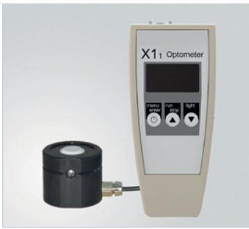
◆ FIGURE 2 Gigahertz-Optik X11 radiometer with UV-3725 detector (Puchheim, Germany)