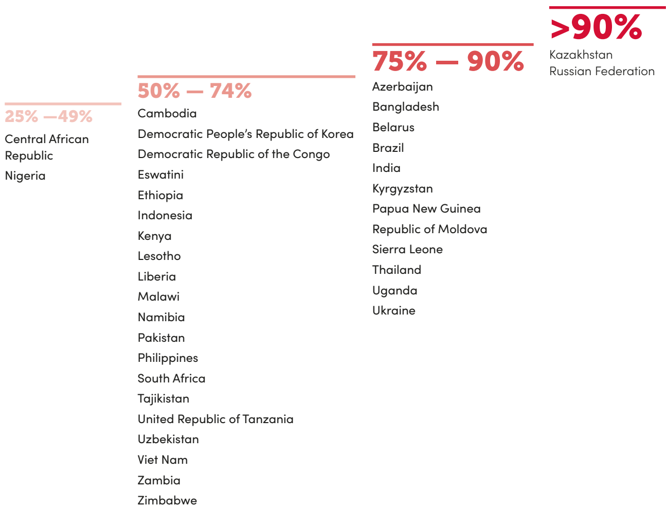
GRAPHIC 1 Percentage of people with TB diagnosed and notified to WHO in Step Up for TB countries (2019)

globally. 1 Still too many who are diagnosed and notified have been tested using slower and less accurate smear microscopy. Unless the policies outlined in this chapter are updated and implemented, millions of people with TB disease will continue to be lost along the diagnostic pathway, and risk being prescribed ineffective treatments or no treatment at all. Millions of others will be diagnosed late, worsening treatment outcomes and spreading disease further.