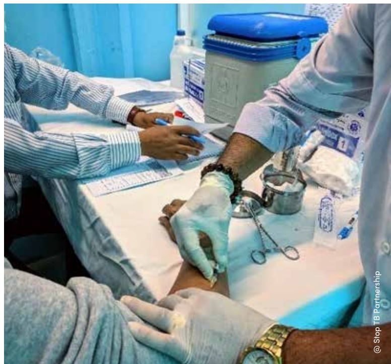
A tuberculin skin test is administered in Vietnam.

The Global Plan to End TB aims for 100% coverage of contact tracing and TB screening among all household contacts of people with bacteriologically confirmed pulmonary TB disease by 2022. 41 Most (31/37, 84%) countries policies' indicate that all household contacts of a person with bacteriologically confirmed DS-TB should be investigated for signs and symptoms of TB disease. However, contacts aged 5 years and older are only eligible for TPT in the policies of 19/37 (51%) countries.