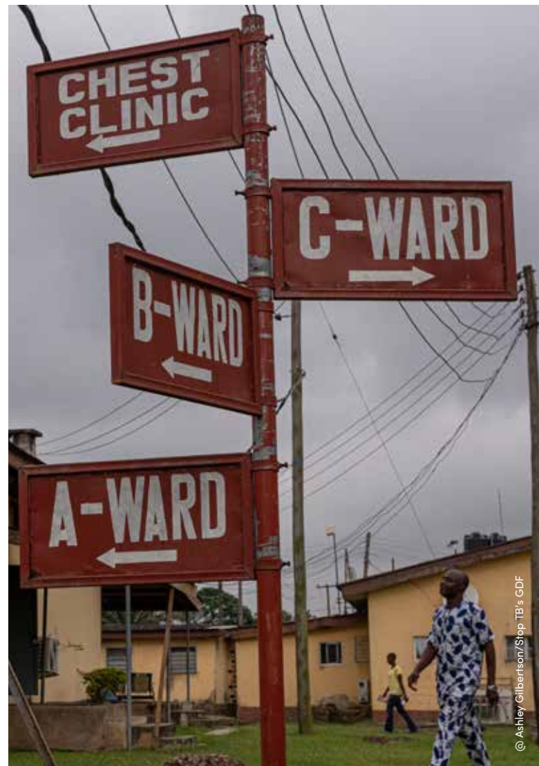
Mainland Hospital, Lagos, Nigeria

The registration data compiled by GDF is based on information given by suppliers during GDF's last tender beginning 2019, which was then validated by GDF. Where GDF has supported country registrations, additional information has been integrated, but the data have not been systematically updated since early 2019. GDF does not have country registration information for 7 Step Up for TB countries (Bangladesh, Central African Republic, Democratic People's Republic of Korea, Lesotho, Papua New Guinea, Russian Federation and Sierra Leone).