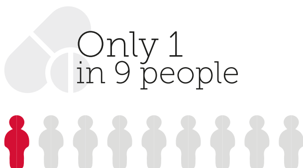
GRAPHIC 3 Bedaquiline treatment coverage, 2015 to 2019

who could benefit from bedaquiline received the medicine between 2015 and 2019