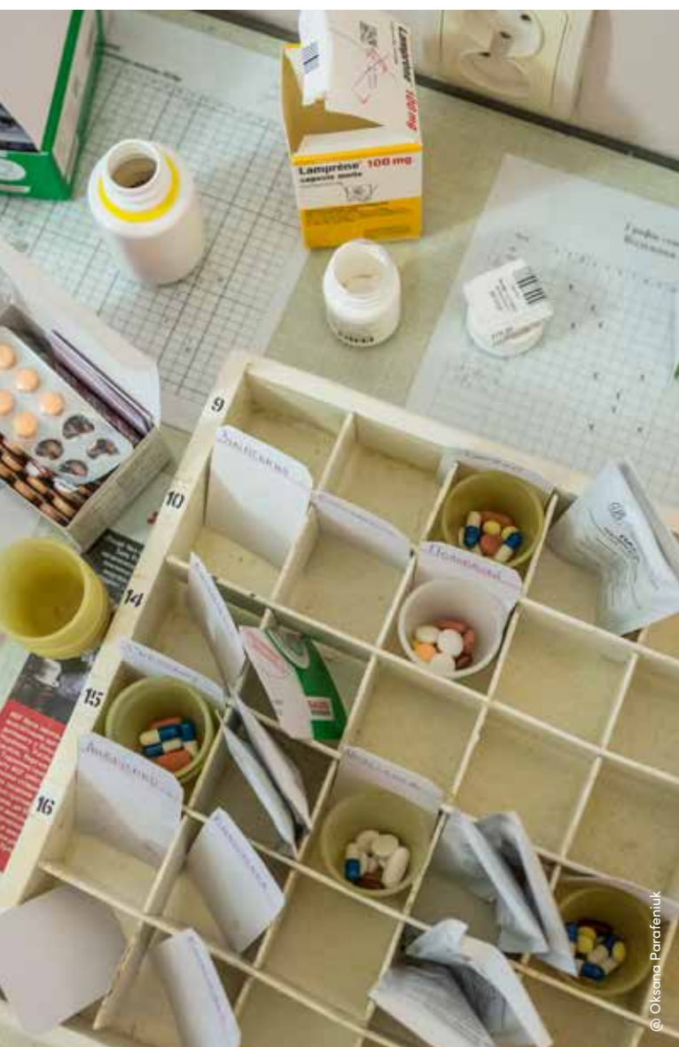
Medication being prepared by a Ministry of Health nurse before being distributed to patients at the Zhytomyr Regional TB Dispensary in Ukraine.

In parallel with registration, national laws should also include early-access mechanisms, such as compassionate use, named-patient basis or clinical access programmes. These mechanisms enable importation of non-registered medicines, including new medicines in the final stages of clinical development before they are registered. Countries that used these mechanisms to access bedaquiline and delamanid scaled up coverage more rapidly once they were recommended for routine use. 106 Unfortunately, 7/37 (19%) survey countries still do not allow early access by law. With the TB treatment pipeline more robust than in previous years, countries should urgently update national laws to enable early access and benefit from future scientific breakthroughs in a timely manner. 107