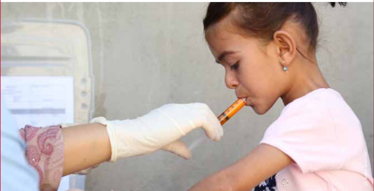
A child receives a compounded TB treatment in Dushanbe, Tajikistan.